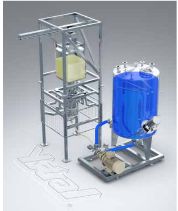
图 1: YSTRAL Conti-TDS 与循环罐和大袋解包站 Figure 1: YSTRAL Conti-TDS with process tank and big-bag station

产品品质的恒定一直是高速分散机的最大问题之一。粒度、色强度、粘度、消光效应和成膜效果都受到操作者添加粉料方式的影响。不同批量，不同操作员，品质都在变化。较慢地添加粉体导致加工时间过长，温度更高，粘度更低；较快地添加粉体又会导致更多的结块和进一步延长加工处理时间，更长时间的剪切，更高的温度和更低的粘度。高速分散机的批次总是要经过质检-调整-再次质检和调整。这些步骤耗费了时间，且在等待质量检查结果的过程中延缓了工艺进程。