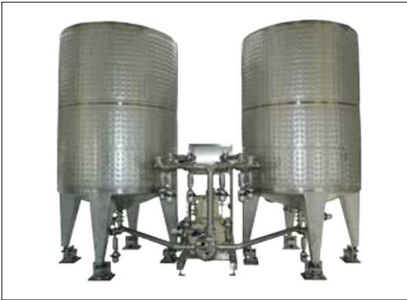
图 4：位于两台工艺储罐之间的 ContiTDS-5 Figure 4: ContiTDS-5 between two process tanks

产成本通常降低10%。此外，因为分散更好、着色强度更高和所需的增稠剂更少，原料用量可以显著减少。通常可将生产时间缩短到20%。因此，用户报告节省超过35%的能源。一般来说，ContiTDS保证了更高的产品质量，更高的生产灵活性和更高的安全水平。