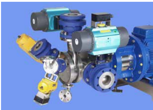
图 2: YSTRAL Conti-TDS 与液体和粉体连接 Figure 2: YSTRAL Conti-TDS with liquid and powder connections