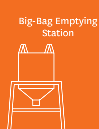
Big-Bag Emptying Station