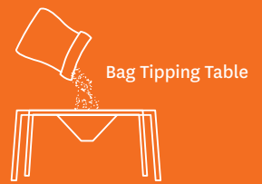
Bag Tipping Table