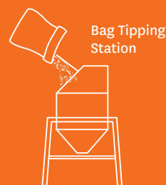
Bag Tipping Station